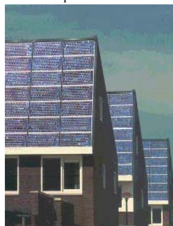
Photo: The 1 MW p PV project in Amersfoort, the Netherlands

The Proceedings have been produced by Halcrow Gilbert.